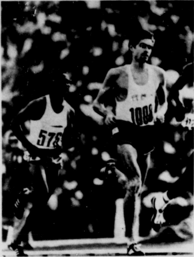
Kip Keino (left) and Jim Ryun competing in one of many races during the Olympic Games.

Unlike the Bannister-Landy duels, however, Ryun won his share. The two became good friends off the track, respecting each other's talents. Neither dominated the other. The two had one last chance in Munich to race and decide which was superior. But a