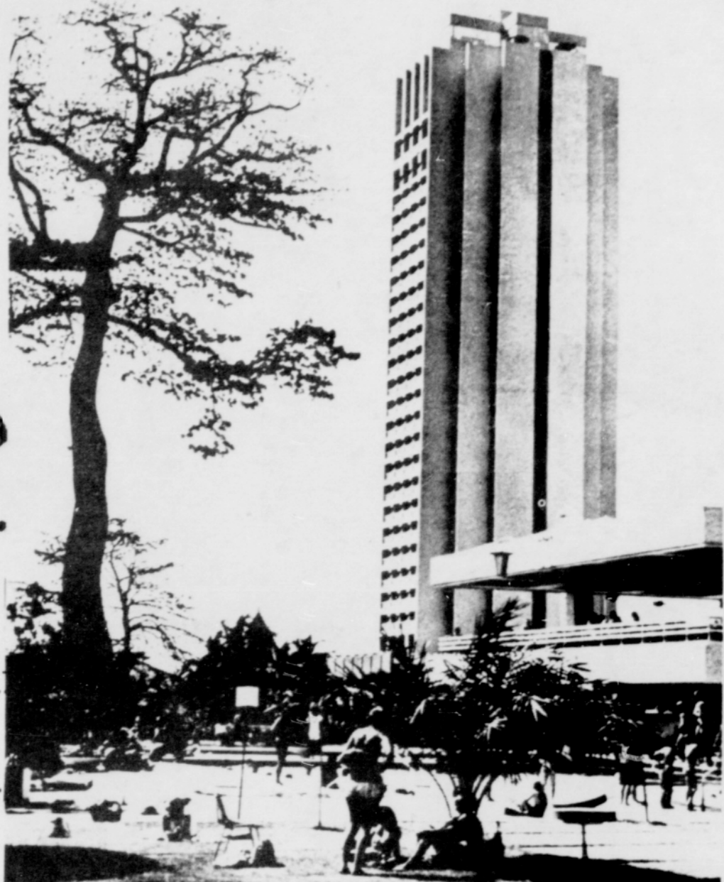
OPULENCE IN AFRICA is featured at "break through" prices on Air Afrique's new 14-day safari to Senegal and the Ivory Coast. For only $799, including air fare, you stay at posh hostels like Abidjan's Hotel Ivoire (above) and visit all the marvels of modern and traditional West Africa.

Write for FREE 1973 CATALOG filled with New Wigs, Jewelry, Girdles and Bras, Hair and Skin Aids etc. GOLD MEDAL PRODUCTS Dept 4, Inwood, L.I., N.Y. 11696