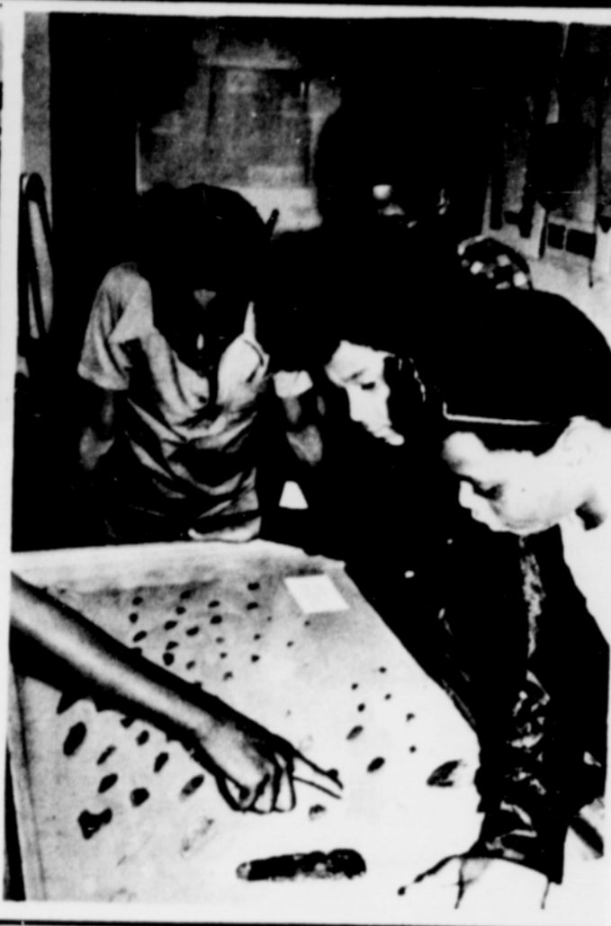
Students of the St. Andrew's Summer Time Program earned money for a five-day trip to Canada by helping with community clean up, fix-up and paint-up projects.