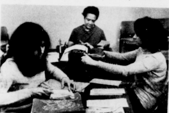
In the months ahead, March of Dimes volunteers in many areas will answer requests for information about Rh blood disease.