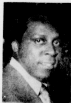
VERNON JORDAN JR.

The bright lights of Christmas are shining. The season of faith, hope and trust is upon us. But there seems to be a flagging of faith, a lessening of hope, and a growing mistrust abroad in this great land.