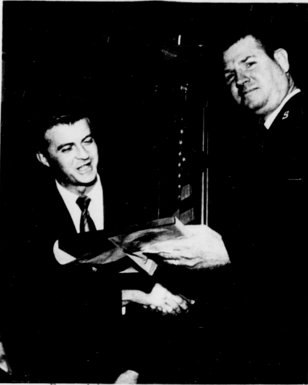
Emanuel hospital receives a plaque from the Salvation Army for community services that the hospital has rendered to the Portland community as a whole.