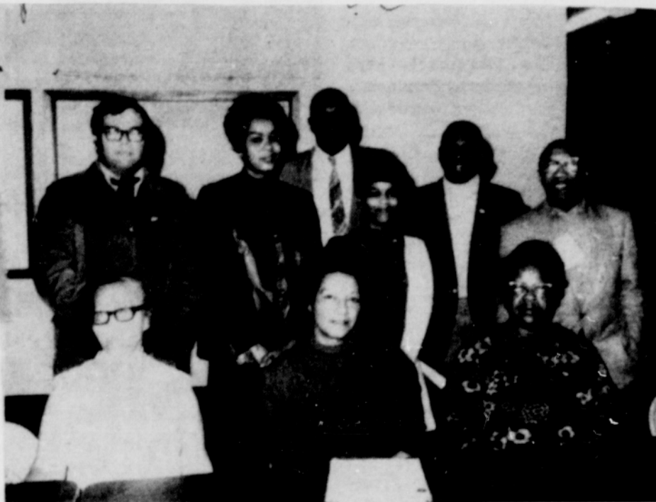
The destiny of the Portland branch NAACP LIES IN THE HANDS OF THESE COMMITTEE CHAIRMAN. Do you know these people who are working for you?