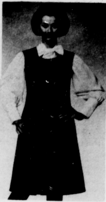
MIXI COMPROMISE HEM LENGTH

After several years of red tape, authorities were finally persuaded to permit mini skirt lengths only to find that the maxi is now the length preferred by Israeli youth. Consequently, the young Israeli girls change into a maxi dress on weekends, and back into their minis when they return to duty.