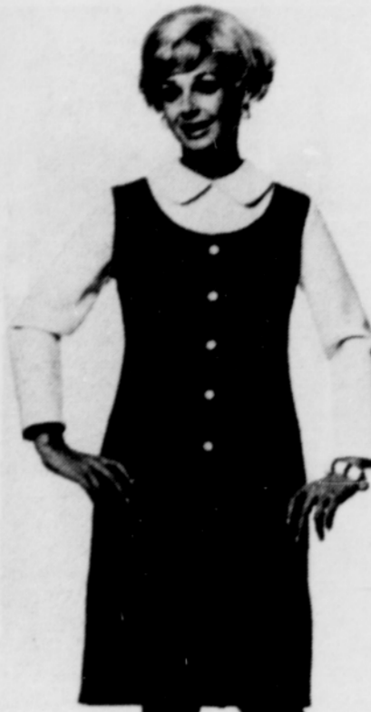
FAMILIAR JUMPER LOOK IN MIXI

Fashion League Photo Mass fashion houses such as Flutterbye have adopted a compromise hem length that might be called the mixi, crossing the kneecap. Here it appears in a jumper of brown or red bonded Orlon acrylic, with an easy A-line torso, low buckled band and box-pleat panel front. Blouse added for photograph.