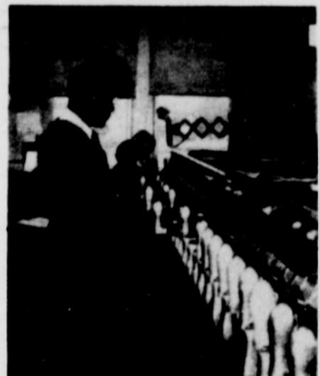
PART OF THE business is relaying information over the direct communication system.