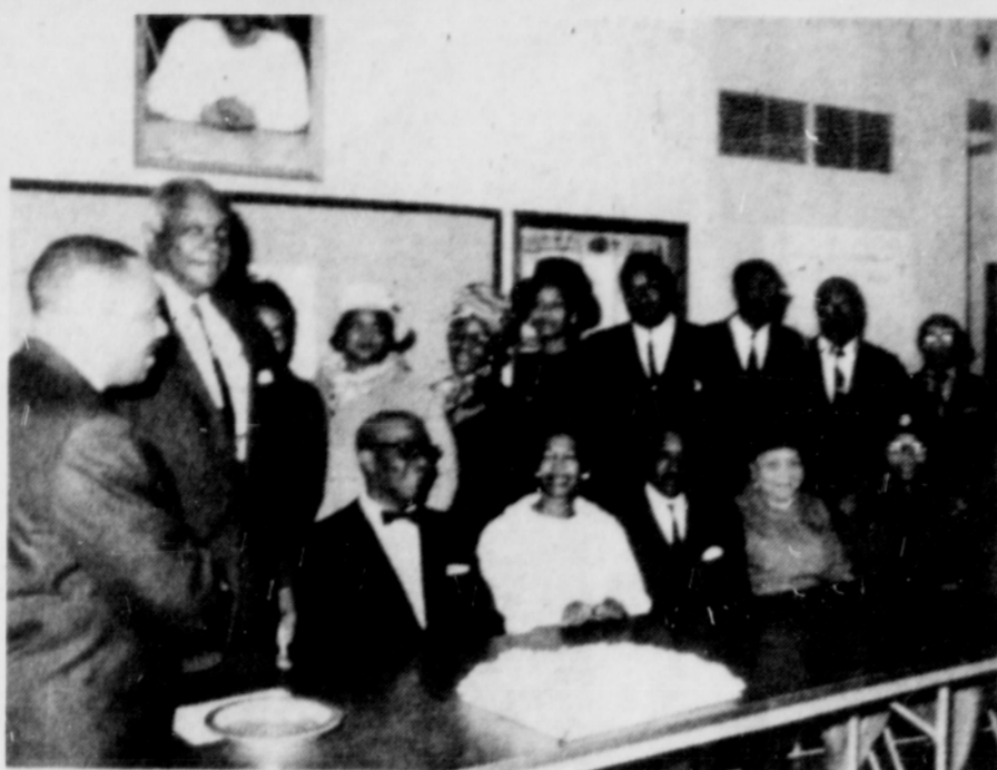
Union Ushers Installation Service held at Bethel.

After all, understanding is a matter of the head. The desire to please is of the heart. No man can fully understand God. If he could, he would be as wise as God. Men cannot analyze God, though theologians may try. His thoughts and His ways are above and beyond the comprehension of the human mind. But God can be obeyed. God does not demand that men understand all the marvelous grace behind the plan by which He saves a poor lost soul. He invites them to trust that grace. In simple faith and trust salvation is found. It is not by the brilliance of their intellectual grasp that men please God. He delights rather in a heart that is turned in childlike trust to him. "Verily I say unto you, Except ye be converted, and become as little children, ye shall not enter into the kingdom of heaven" (Matthew 18:3).