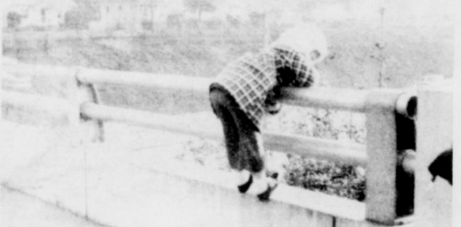
THE RAILING on the Minnesota via duct is on 3'10" high. Our camera man caught this little four year old leaning over to watch a car below speeding at a rate of 70 miles per hour. Imagine if she should fall what would happen?

property and lives of those traveling on the freeway below these viaducts," Mrs. Milburn said.