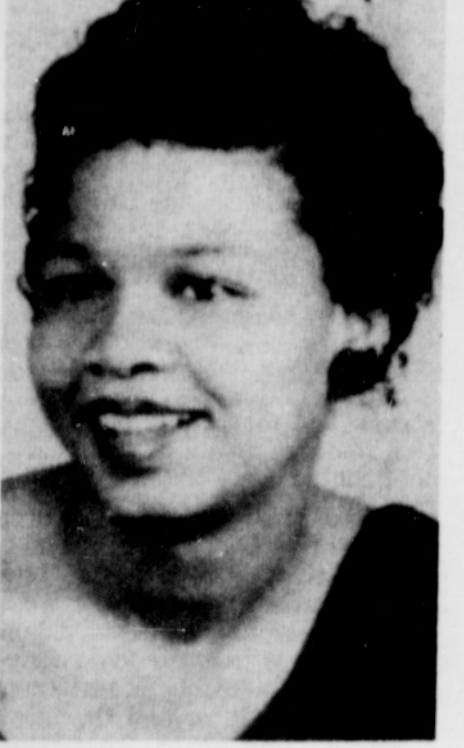
Hungriest family in America

Every mother says it. Black mothers mean it.