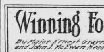
WEST POINT FORWARD PASS.