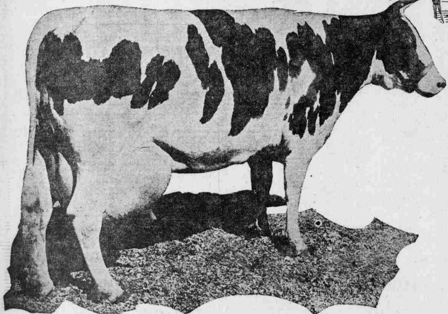
THE WORLD'S GREATEST MILK COW IS HERE "Prospect," whose official name is Segis Pietertje Prospect, and who holds the world's record for milk production over all breeds, amounting to 18,690 quarts of milk in one year, has just arrived at the stock show. This is her first trip away from home. It is an opportunity of a lifetime to see this great cow.