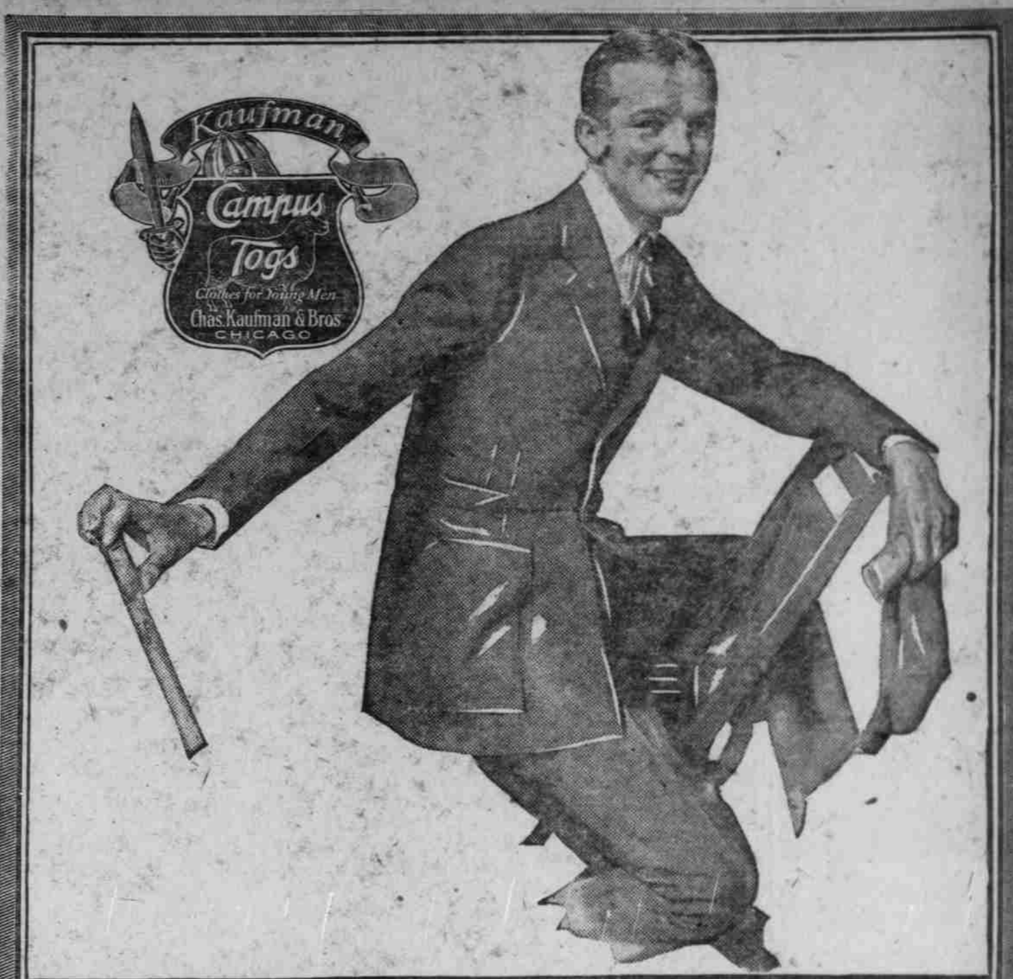
Clothes Designed by Kaufman