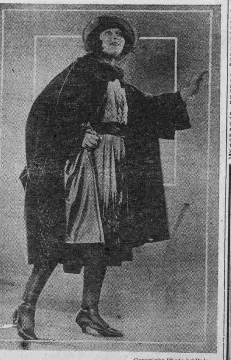
A cape which demonstrates one way in which women are going to keep warm this autumn. Apparently the wearer had not heard of the Paris long-skirt decree.