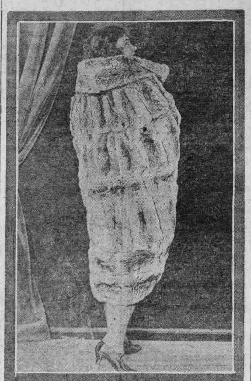
Looking forward to the time when heavier garments will be the vogue, fashion-setters have designed the above chic coat.

WHEN WINTER COMES, HERE'S ONE WAY TO KEEP COLD OUT.