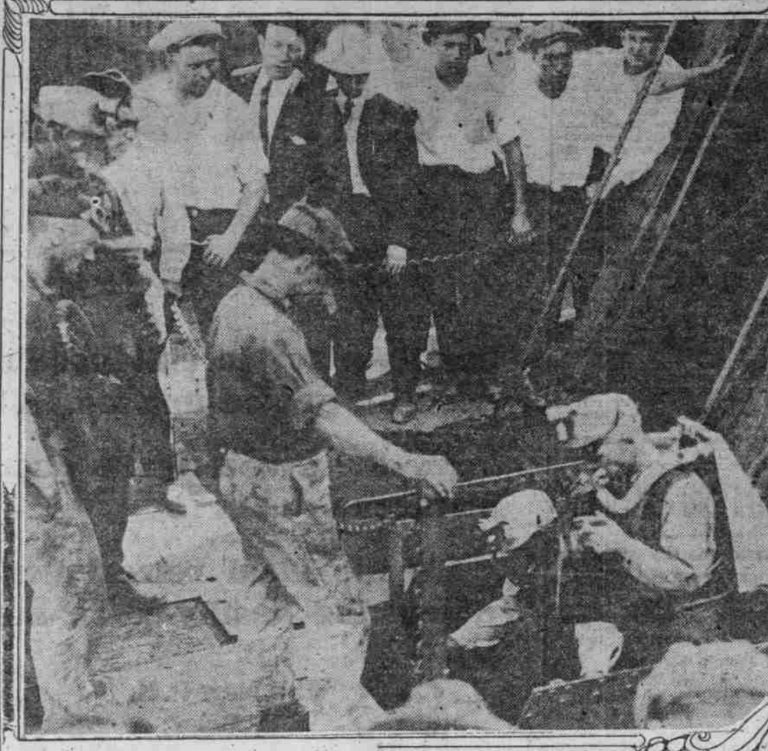
Photo shows a rescue squad going down a shaft at Jackson, Cal., in an attempt to reach the 47 miners who have been entombed in the Argonaut gold mine since a week ago last Sunday. The fire which trapped the miners was quenched early last week.