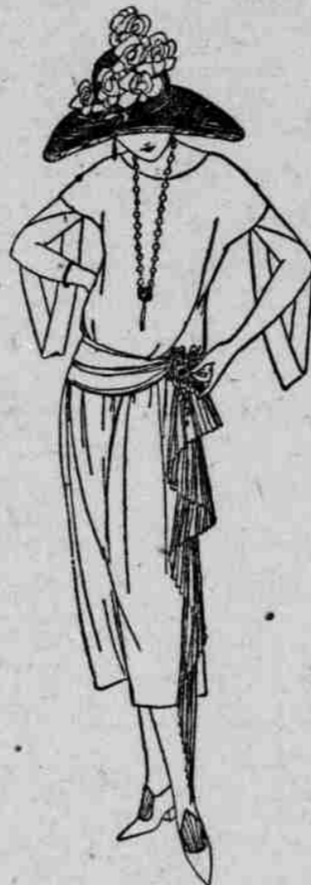
S. & H. Stamps

Second Floor—Beautiful Dresses for all occasions. Depleted lines of the season's most fashionable styles. Crepe de Chine, Canton Crepe, Taffeta and Tricolette. Straightline and blouse effects. Trimmed with braids, beads, ruffles, embroidery, etc. Navy, orchid, brown, jade, henna, $25 black, etc. Values to $49.50, special