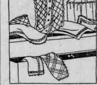
S. & H. Stamps

—Anniversary Sale Main Floor—The woman who loves dainty neckwear will find this a wonderful opportunity to choose at a big saving. Organdie Vestees in Peter Pan style with full bodice Organdie Guimpes—Gingham Vestees with Organdie inserts—Net Guimpes with cascades, etc. Special only $1.95