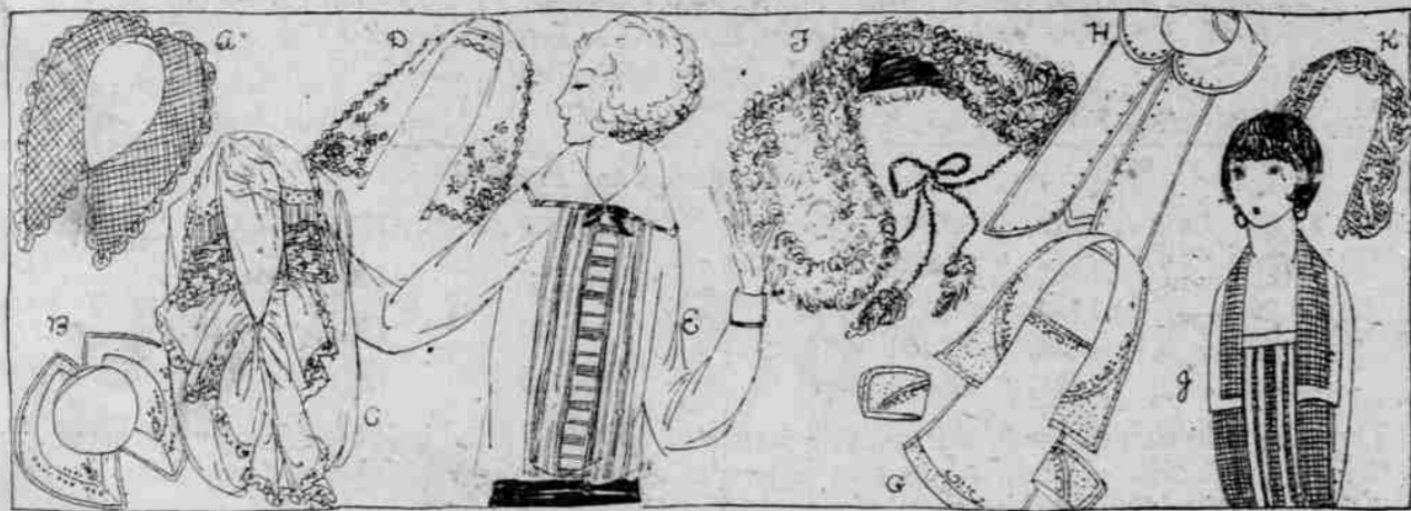
(A) $1.25 gingham sports collar, 50c; (B) $1.25 linen sports collar, special 50c; (C) $2.95 net and lace guimpe, special $2.95; (D) 35c embroidered net collar, special 50c; (E) $6.95 striped voile vestee and cuff set, special $1.99; (F) $6.95 ostrich trimmed Marabou collar, special $2.95; (G) $6.95 linen sports vestee and cuff set, special $1.99; (H) $1.75 linen vestee and cuff set, special 50c; (I) $1.50 gingham sports vestee, special 50c; (K) $1.50 real filet lace collar, special 75c.