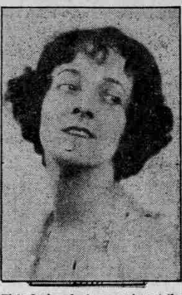
Elsie Janis, who is appearing at the Hellig Theater.