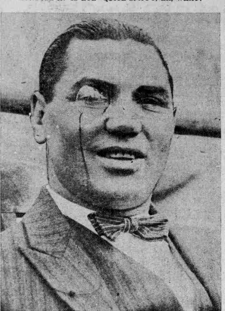
JACK DEMPSEY.

NEW YORK, May 24.—The large crowd that gathered around the pier as the Aquitania docked recently in New York just simply gasped when the heavyweight champion, Jack Dempsey, walked down the gangplank wearing a "pane o' glass" in his right eye like an English gentleman.