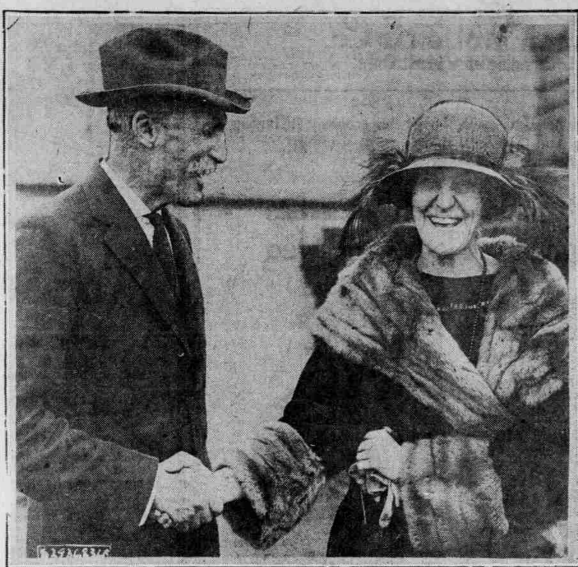
MR. AND MRS. GIFFORD PINCHOT. This shows Mr. and Mrs. Gifford Pinchot just after the nomination of the former for governor of Pennsylvania had been assured. The Pinchots were intimate friends of the late President Roosevelt and often heard him use the "delighted" they are echoing today. The republican nominee denied that he had any thought of running for president two years from now. He added that the republicans of Pennsylvania will stand united in support of President Harding. Mr. Pinchot still continues to receive congratulations from all parts of the country. One telegram that pleased him much was from Mrs. Theodore Roosevelt, wife of the late president. "Hurrah for Pennsylvania," she wired. "Your friends are delighted."