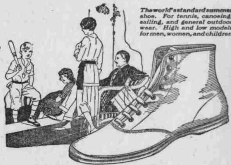
The world's standard summer shoe. For tennis, canoeing, sailing, and general outdoor wear. High and low models for men, women, and children.

They are not Keds unless the name Keds is on the shoe