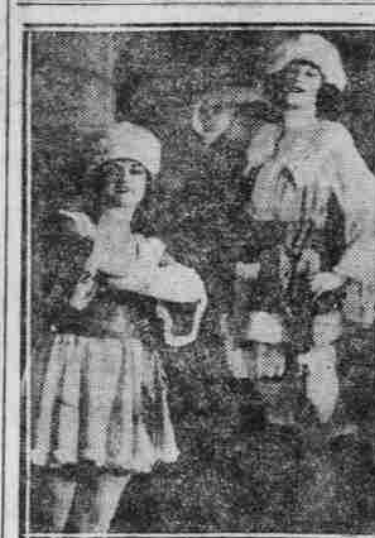
Two of the Wright dancers, at the Orpheum today.

The Orpheum show, of which on of the headline acts is the Wrigh dancers, one of the most notable dan