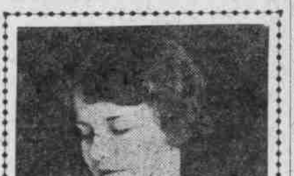
Viola Dana, screen star, who comes here in person soon.

Viola Dana, screen star, will appear in person at Loew's Hippodrome theater next week.