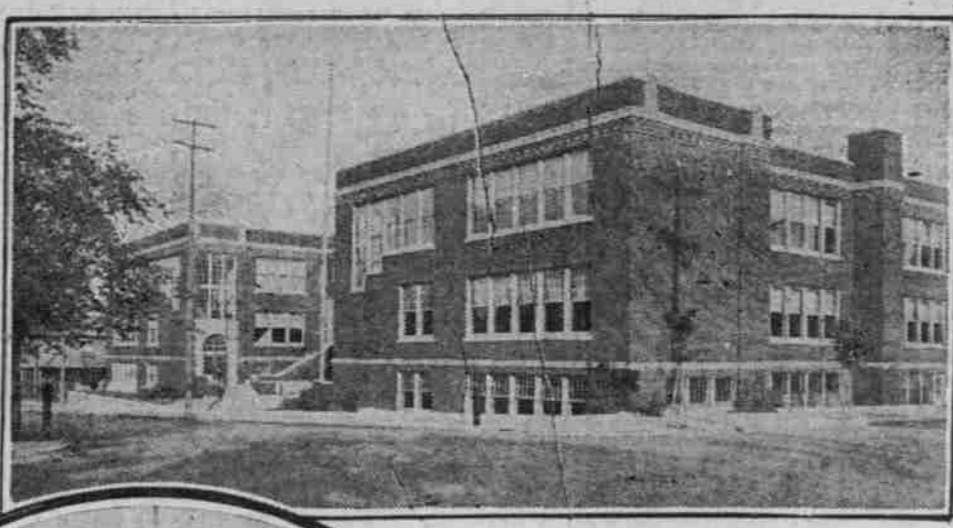
Shattuck School, a Type of the Portland System