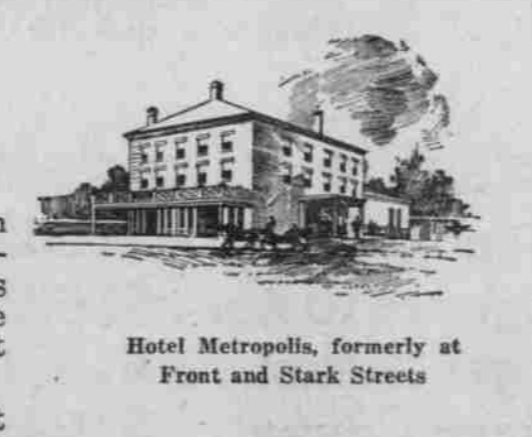
Hotel Metropolis, formerly at Front and Stark Streets