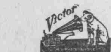
SHERMAN, CLAY & CO., Wholesale Distributors of Victrolas and Victor Records

Two of the many Victrola models, whose range in price is from $25 to $1500, are shown on this page. The dealer who SPECIALIZES in Victor goods is, of course, particularly well equipped, in merchandise and experience, to give you Victor service. Any Victor dealer will gladly arrange convenient payment terms.