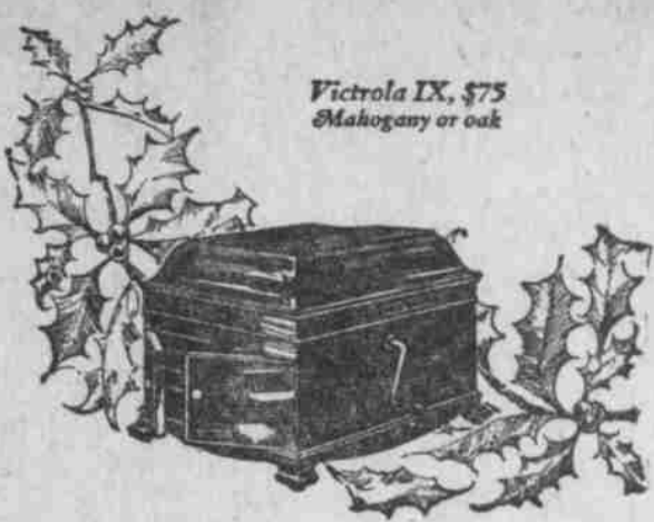
Victrola IX, $75 Mahogany or oak

Duties as Vice-President of First National Bank to Be Resumed. Job to Be Left Tomorrow.