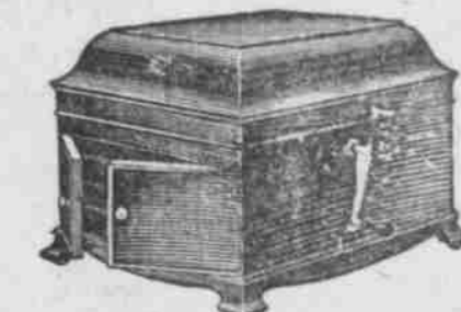
Victrola IX, $75 Mahogany or Oak