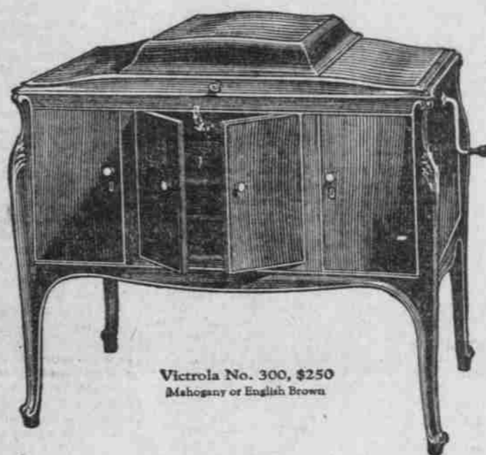
Victrola No. 300, $250 Mahogany or English Broom