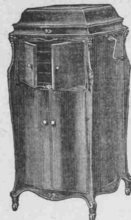
Victrola No. 130, $350 Victrola No. 130, electric, $415 Mahogany or Oak

No matter which style Victrola you select it offers the greatest obtainable value at the price—whether $25 or $1500, but look for the Victor trademark on the instrument you buy.