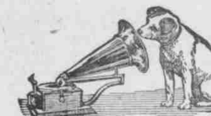
"HIS MASTER'S VOICE" REG. U.S. PAT. OFF.