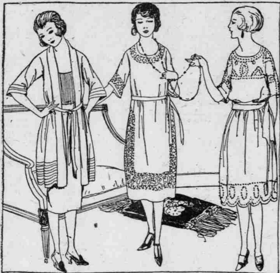
THREE OF THE STYLES SKETCHED.

—Meier & Frank's: Main Floor. (Mail Orders Filled.)