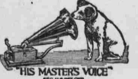
HIS MASTERS VOICE VICTOR TALKING MACHINE CO. Camden, N. J.

PUBLIC approval follows artistic leadership. The Victrola stands alone. The great artists who make records for it have by that simple fact given it the strongest possible endorsement. Victrolas $25 to $1500. New Victor Records demonstrated at all dealers in Victor products on the 1st of each month.