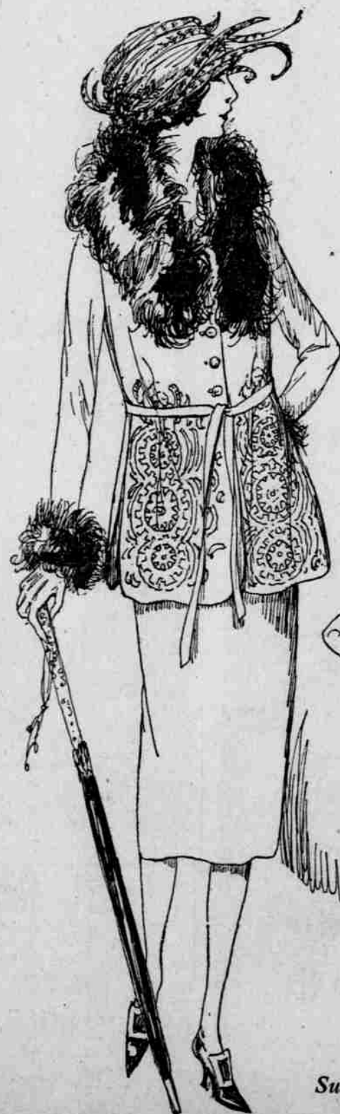
Suits Sketched at $57.50