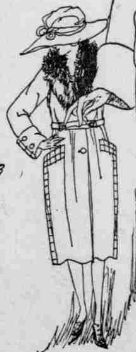
Coats Sketched at $39.75