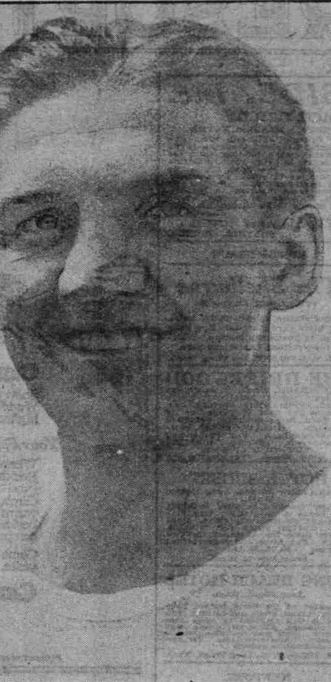
GEORGES CARPENTIER.

Jack Dempsey evidently believes that "Life is real; life is earnest and the grave is not the end"—if one is to judge from his pictures. Georges Carpentier takes it with a laugh and a song and a smile when he isn't fighting. But they do say he looks like "gray ice" when he's really in the ring for business.