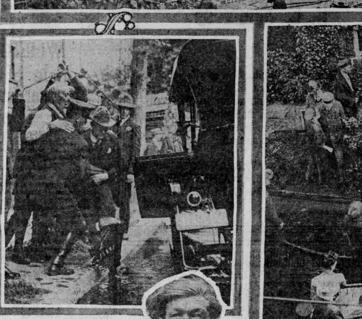
1 KILLED, 7 HURT IN FIRE $75,000 BLAZE SWEEPS MAY APARTMENT HOUSE.

Several Are Rescued After Smoke and Flames Seem to Have Cut Off Their Escape.