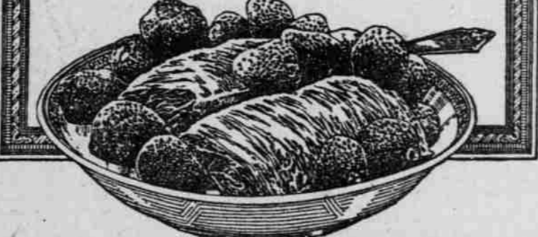
Shredded wheat cereal with milk and fruit.

Pacific Coast Shredded Wheat Co., Oakland, Cal.