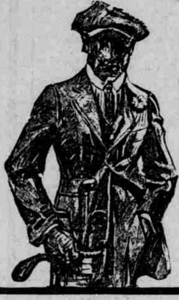
Fifth Floor—Lipman, Wolfe & Co.

—In smart checks, plaids and plain shades. Sizes 36 to 42, inclusive.