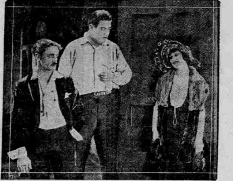
MOMENT FROM "BLIND YOUTH," WHICH OPENS AT THE STAR TOMORROW.

TODAY'S FILM FEATURES. Columbia—Pola Negri, "Pas-sion." Majestic—Harold Lloyd, "Now or Never." Rivoli—Roscoe (Fatty) Arbuckle, "Brewster's Millions." Peoples—Katherine MacDonald, "My Lady's Latch Key." Liberty—William S. Hart, "O'Malley of the Mounted." Star—Edith Roberts, "The Fire Cat." Circle—Bert Lytell, "The Mis-leading Lady." Hippodrome—Gladys Walton, "All Dotted Up." Globe—Babe Daniels, "Every-woman."