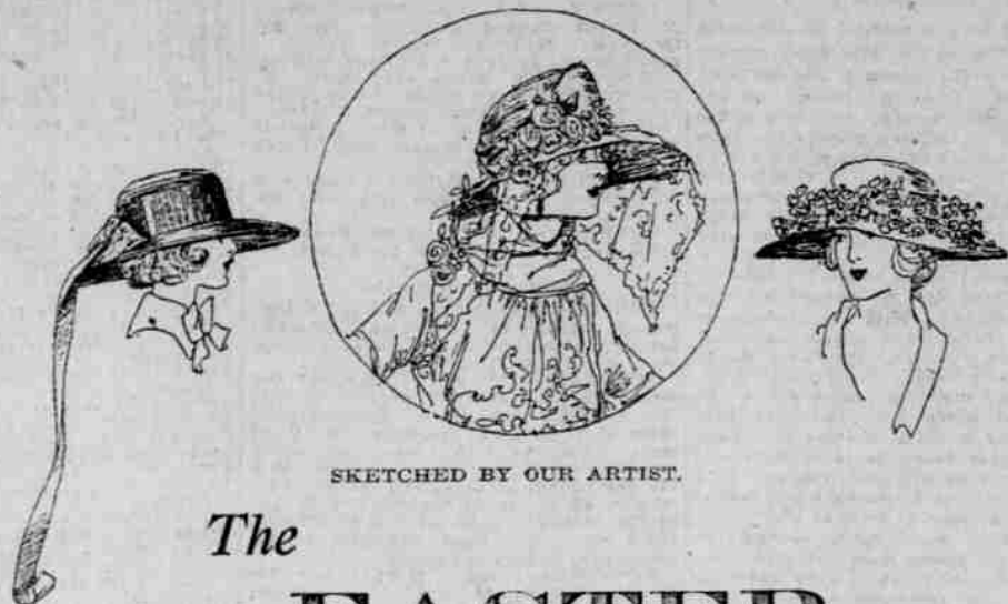
SKETCHED BY OUR ARTIST.