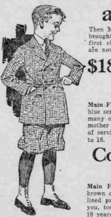
On Sale Today at Bargain Circle, Main Floor