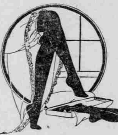
On Sale Today at Bargain Circle, Main Floor