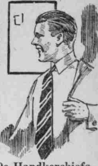
On Sale Today at Bargain Circle, Main Floor