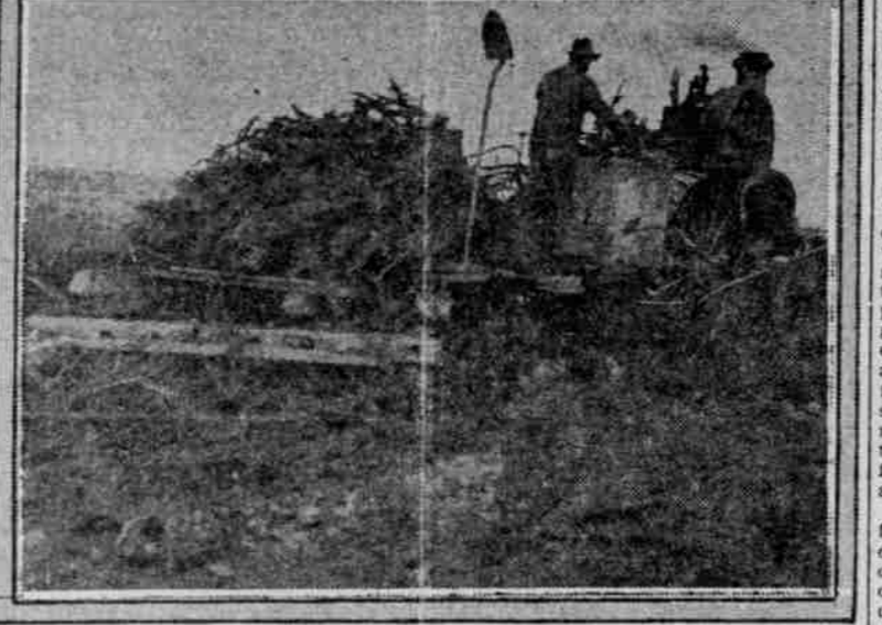
Above—Work of digger on reclamation project. Below—Clearing brush from land preparatory to irrigating.