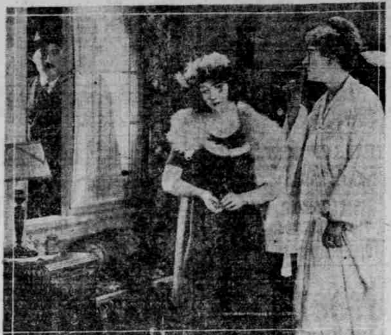
DOROTHY GISH, IN A SCENE FROM "THE GHOST IN THE GARRET," WHICH OPENS TODAY AT THE PEOPLES.