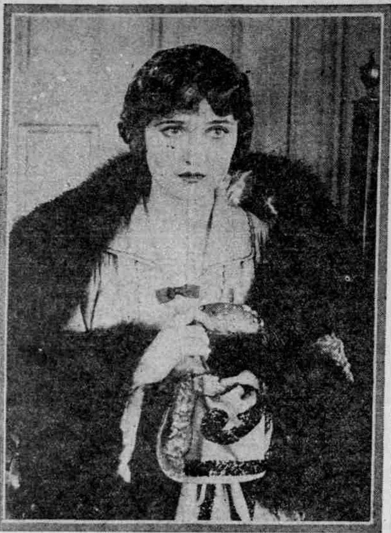
AGNES AYRES, WHO HAS LEADIN G FEMINE ROLE IN "FORBIDDEN FRUIT," AT "THE COLUMBIA."

TODAY'S FILM FEATURES. Columbia—Cecil B. DeMille's "Forbidden Fruit"; M.G.'s—The Truth About Bennett's Rivoli; Bob Daniels, "Oh Lady, Lady"; Fox—Antia Stewart, "Harriet and the Piper"; Liberty—Wesley Barry, "Dinky"; Star—Roy Stewart, "The Devil Circle—Cecil B. DeMille's 'Something to Think About'; Hippodrome—Carmel Myers, "The Mad Marriage"; Globe—Cortine Griffith, "Broadway Bubble";