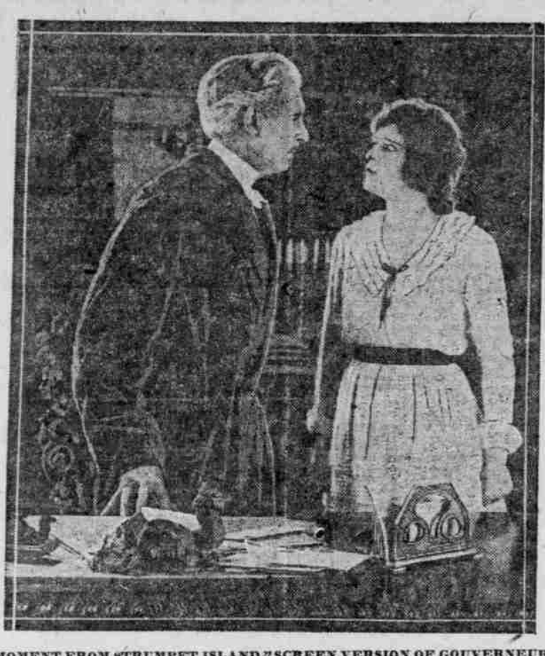
MOMENT FROM "TRUMPET ISLAND," SCREEN VERSION OF GOUVERNEUR MORRIS' STORY, AT THE RIVOLI.

THE world, says Miss Bush, is full of picturesque people and dramatic events, and it is to secure such material as will be a departure from the customary American scope and atmosphere that Miss Bush will tour the world in the interest of future Allan Dwan productions.