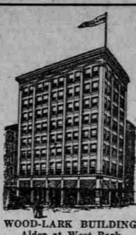
WOOD-LARK BUILDING Alder at West Park.