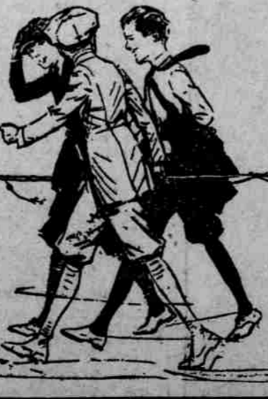
Boys' Store, Main Floor

Sale of Boys' Mackinaws $9.45 —Boys' $12.50 up to $9.45 —$17.50 Mackinaws at $14.95 —$25.00 Mackinaws at $19.95 Sweaters, $5.95 —Boys' heavy Ruff-neck Sweaters in plain brown or maroon—solid colors or body stripes. Sizes 32, 34, 36 only. Regular $12.50 Sweaters at $5.95