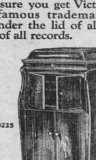
Victrola XIV, $225

To be sure you get Victor products, look for our famous trademark "His Master's Voice"-under the lid of all instruments, on the labels of all records.