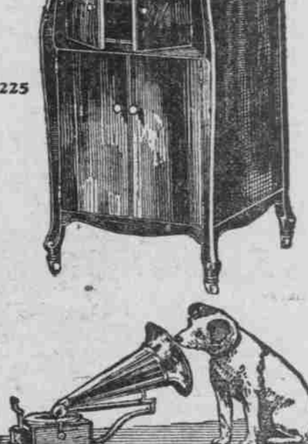
This trademark and the trademarked word "Victrola" i entify all our products, under th. lid. Look on the label!