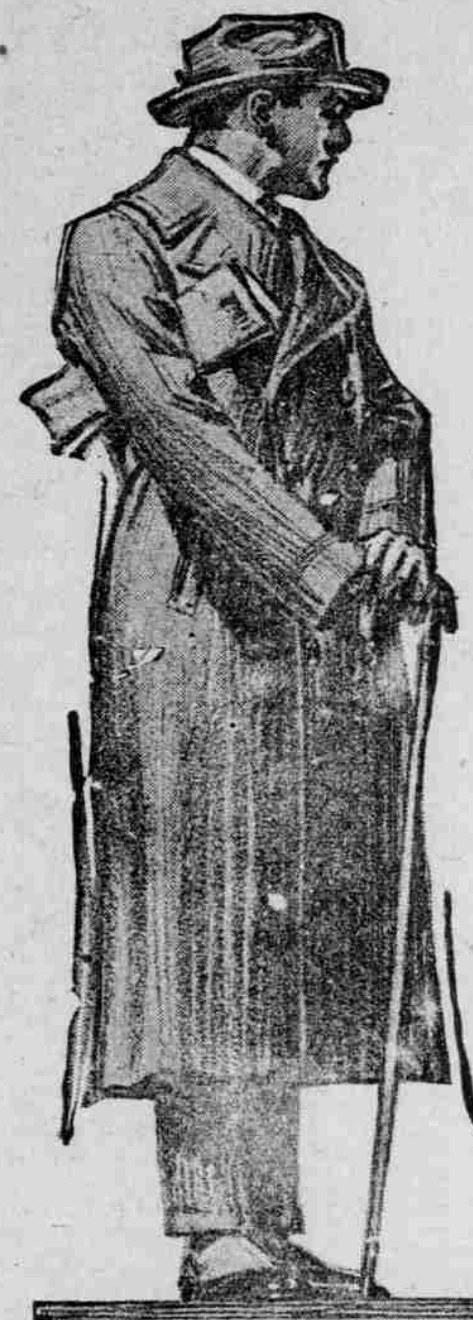
Copyright 1920 Hart Schaffner & Marx

Styles for young men, Styles for older men, —very low price for highest quality—