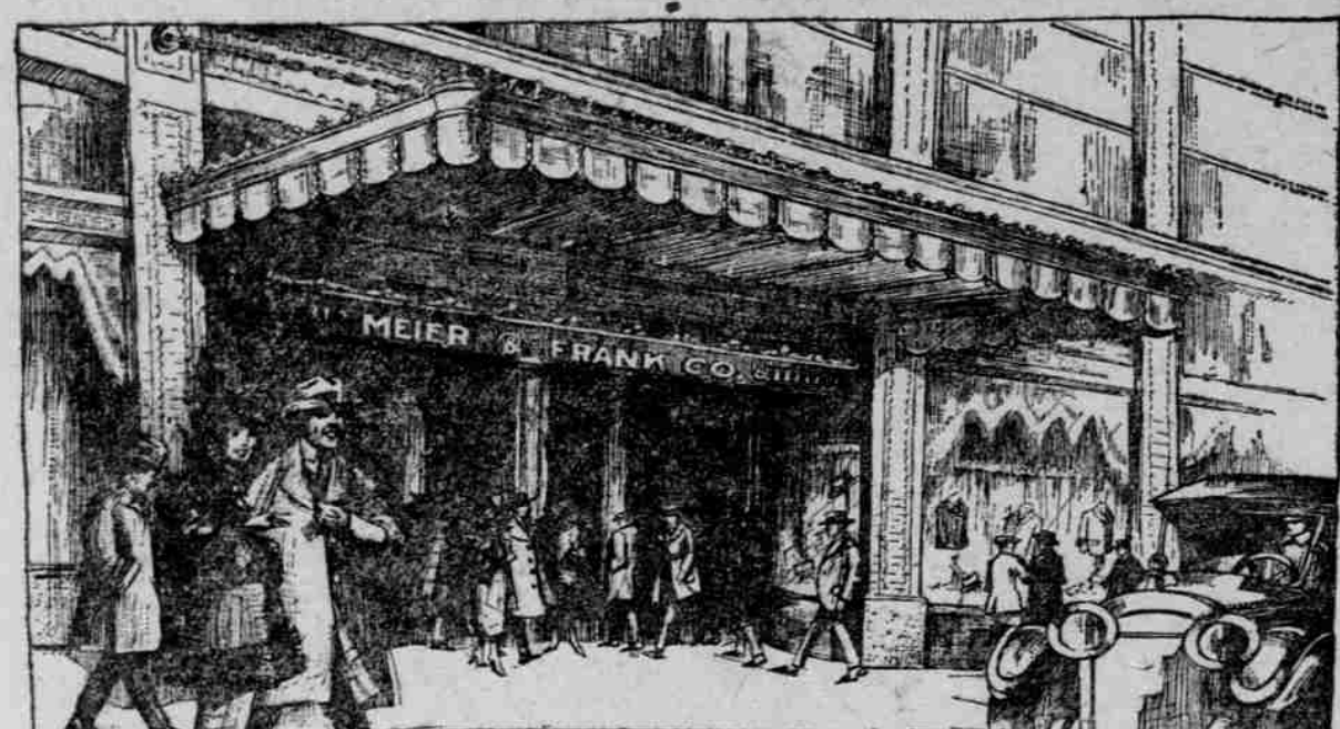
Use Morrison Street Entrance (Pictured) to The Store for Men, Main Floor Take Any "Up" Elevator or Escalator to The Store for Men, Third Floor

Usual Meier & Frank Advertisement Will Be Found on Back Page of This Paper