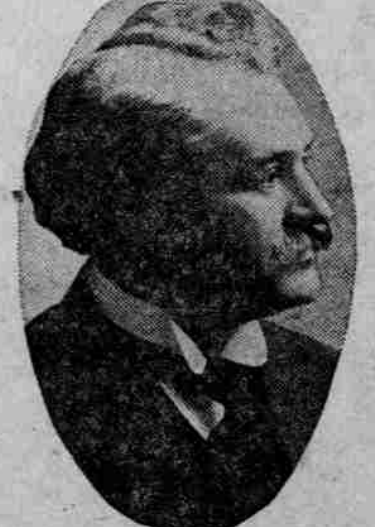
He has saved the taxpayers money. He has always made good. vote for him is a vote for the

municipal paving plant. (Paid Advertisement.)