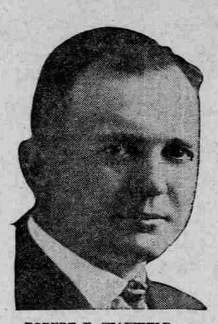
Vote X 40

Protective Tariff is vital to the lumber men, farmers, stock men, business men and working men of Oregon. We must protect our timber, butter, eggs, wheat, sheep and cattle. We cannot compete with cheap foreign labor. American citizens demand better living than foreigners.